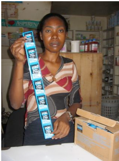
Selling PUR sachets in Haiti