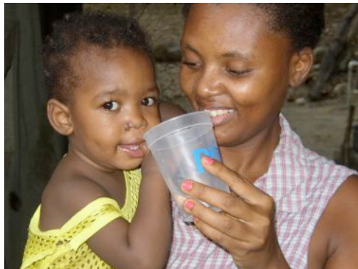
Drinking water treated with PUR (P&G, G. Allgood)