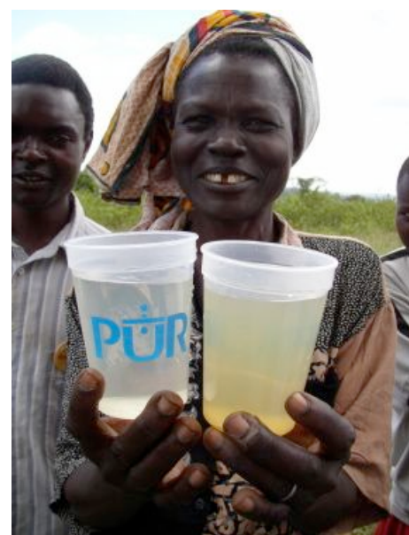
Turbid water in Kenya treated with PUR

Each sachet of PUR is provided to global emergency relief organizations or non-governmental organizations at a cost of $0.035 (3.5 US cents), not inclusive of shipping from Pakistan by ocean container. Transport, distribution, education, and community motivation can add significantly to program costs. Sachets are generally sold at product cost recovery for 10 US cents each, for a cost of 1 US cent per liter treated. Currently, PUR projects operate either operate on partial cost recovery (charging the user only for the product, and subsidizing program costs with donor funds), or fully subsidized free distribution such as in emergency situations. Procter & Gamble sells the PUR sachets at cost, makes no profits on PUR sales, and donates programmatic funding to some projects.